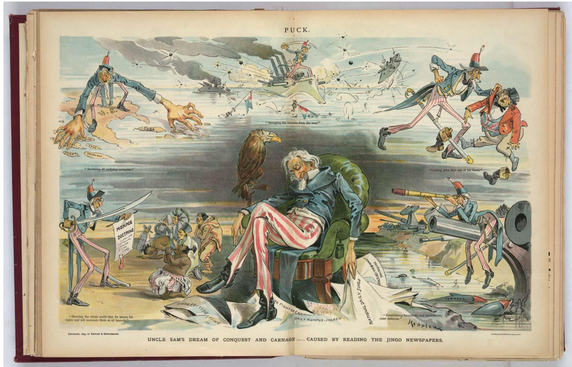
Image created by Udo J. Kepler for Puck Magazine -the first successful humour magazine in the United States of colourful cartoons, caricatures and political satire of the issues of the day. It was founded in 1871