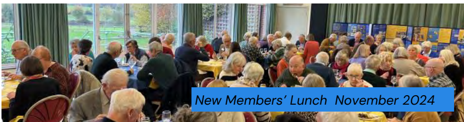
New Members' Lunch November 2024