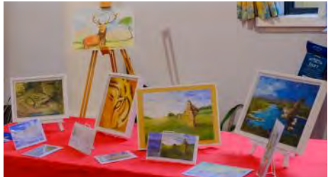
Art Group Display at u3a in Kennet Open Day 2024