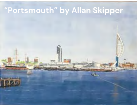
"Portsmouth" by Allan Skipper

If you are interested in forming a new group, please get in touch with our Groups Team at groups@u3ainkennet.org.uk .