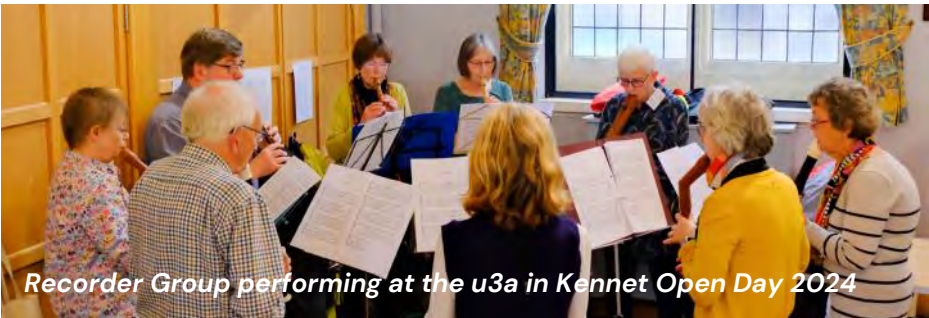
Recorder Group performing at the u3a in Kennet Open Day 2024