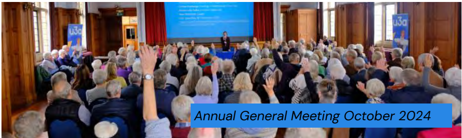
Annual General Meeting October 2024