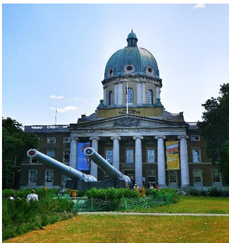
Photograph of the Imperial War Museum by Kate Morison

Everyone was very good-natured and many were adventurous. Such as the lady who went over to Battersea Power Station to take panoramic photos from its tallest tower to the gentleman in his nineties who jumped on a 381 bus to visit HMS Belfast. Those who had booked tickets for the Cartier Exhibition at the V&A said it was magnificent. Others found joy in the Tate Modern, the Royal Academy and the Guildhall Art Gallery.