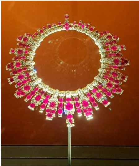
Photograph of the Cartier Exhibition at the V&A museum