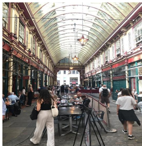
Photograph of Leadenhall Market