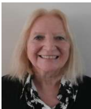
Georgie Neville Groups